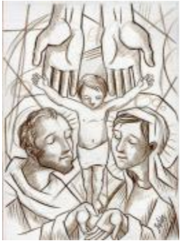
immagine religiosa più o meno grande appesa alle pareti di casa? Dalle parole di Gesù la risposta appare semplicemente chiara: dimostro il mio legame con Gesù nella misura in cui amo il prossimo. Una comunità mostra la propria fede in Gesù dalla capacità di coltivare amore reciproco al suo interno e manifestarlo in parole ed opere. Questo è dunque il vero segno distintivo del cristiano e della comunità dei credenti. Nei secoli le comunità cristiane

Quale è il segno distintivo di un cristiano? Una croce al collo? Una