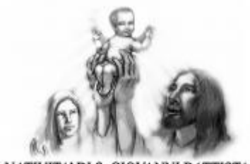
NATIVITA' DI S. GIOVANNI BATTISTA

in lei la sua grande misericordia, e si rallegravano con lei. San Giovanni Battista è il termine paragone indispensabile per ogni cristiano se vuole essere davvero dalla parte di Dio e del bene. Lui che ha indicato la presenza della vera ed eterna luce di Dio nel mondo, il Verbo incarnato, l'agnello immolato per la nostra salvezza, ci faccia comprendere oggi e sempre quanto sia essenziale vivere nella luce, nella verità, nell'amore, nella fedeltà a Dio e alla propria scelta di vita